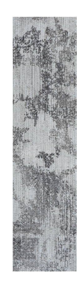
ENTANGLE IN FROST ETG79-144