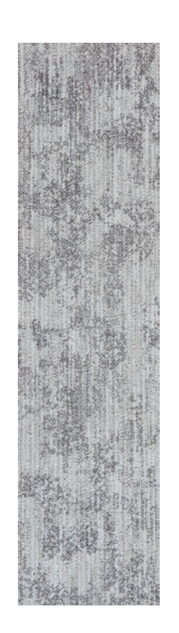
ENLACE IN FROST ENL108-144