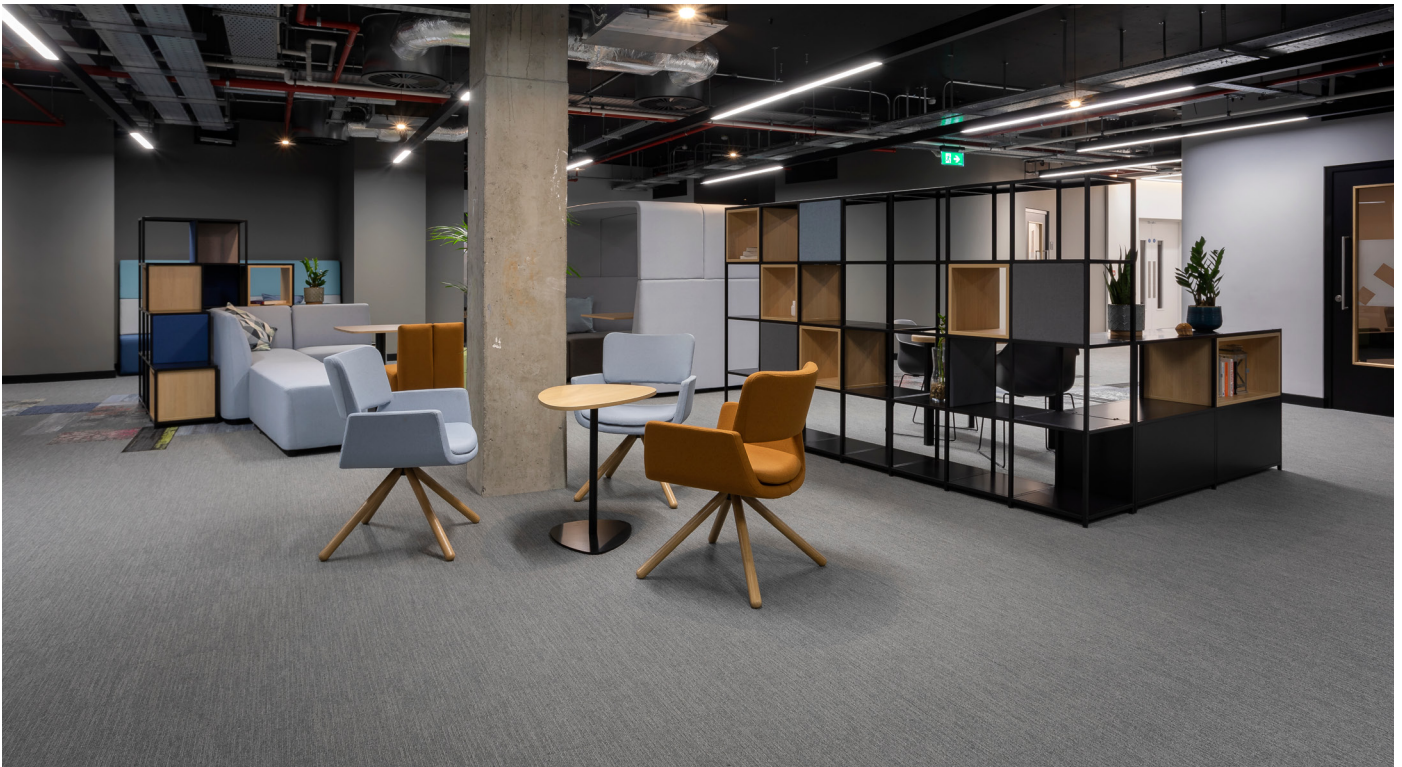
Carpet : Nordic Stories – Isograd

Ensuring that this building project was achieved sustainably was also a key part of the brief for Claremont. As part of Milliken's M/PACT programme , all its modular carpet and LVT products are manufactured sustainably and are now carbon neutral. For this project the client could be assured that the floor covering would have minimal impact on the planet.