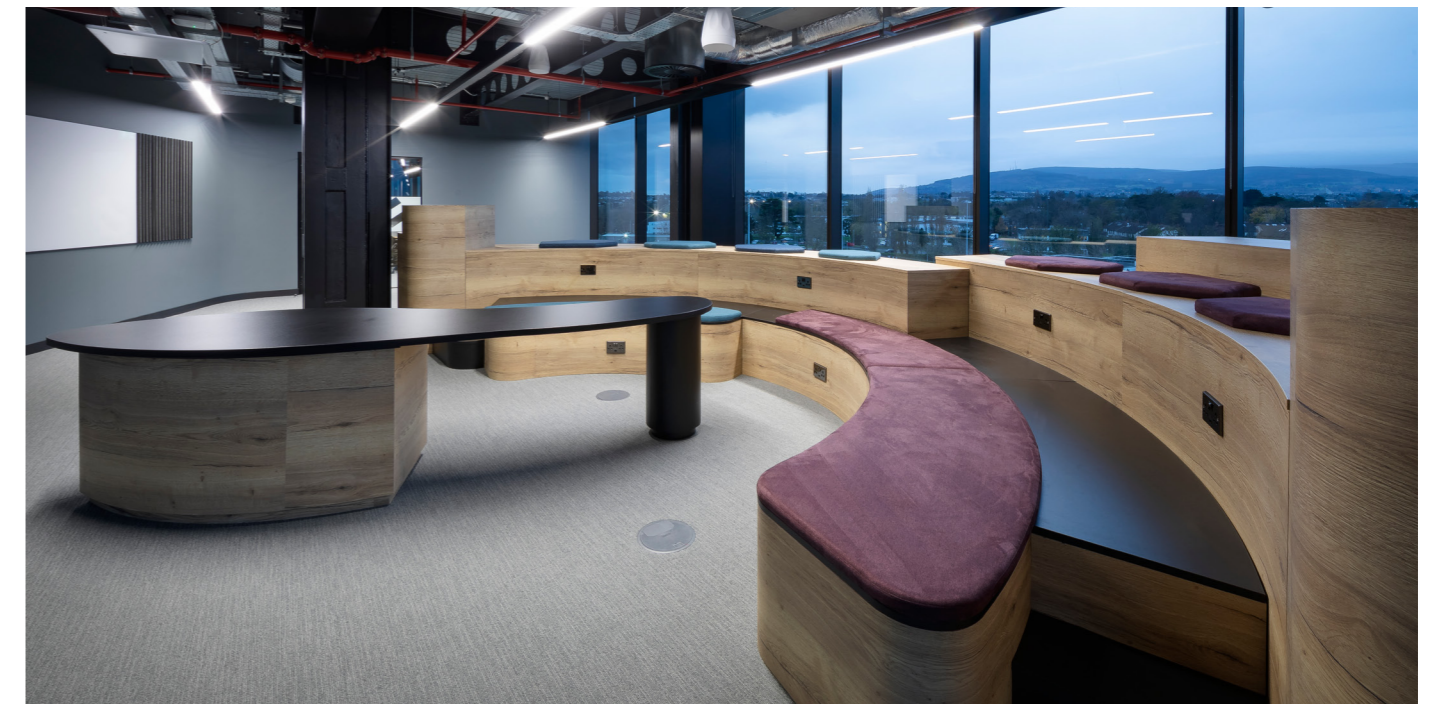
Carpet : Nordic Stories - Isograd

"The Comfort Lite backing means that the carpet helps create a space that is much calmer and more comfortable underfoot."