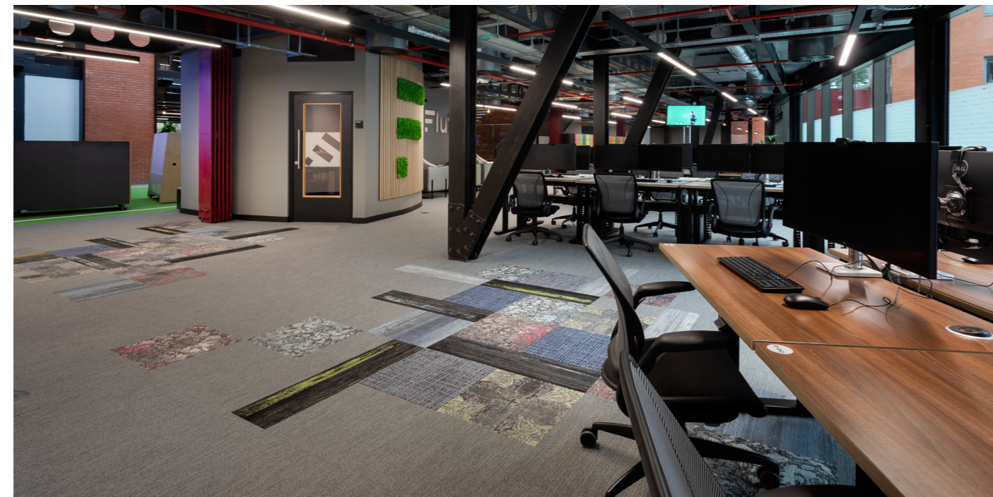
Carpet : Nordic Stories - Isograd, Colour Compositions, Glazed Clay, Urban Collective and Artistic Liberties - Outspoken Tradition, Historic Clashes